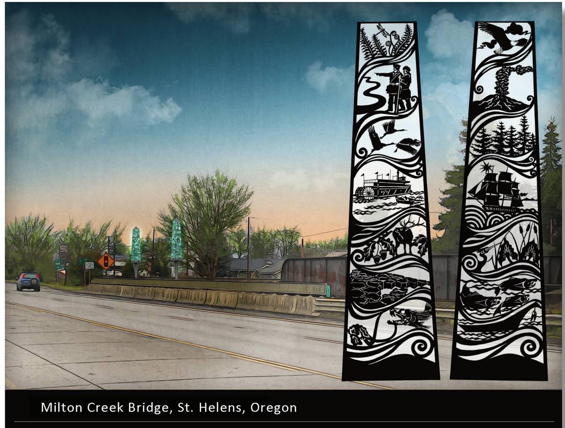
Milton Creek Bridge, St. Helens, Oregon

We ask you to join the Arts and Cultural Commission and make this project a reality. Please participate by donating whatever