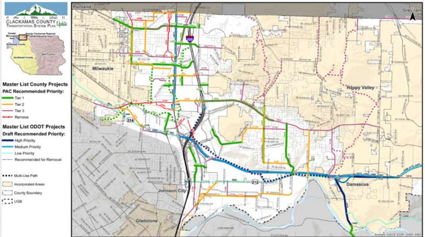
Master List Projects - PAC Recommendation Greater Clackamas Regional Center / Industrial Area